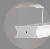
Bottomrail of extruded PVC