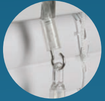
Heavy duty tilter with metal rivet