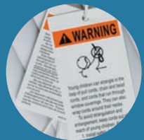
Child-safe tassel & Safety warning tag