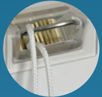
Cordlock with brass roller