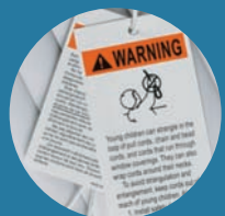
Child-safe tassel & Safety warning tag