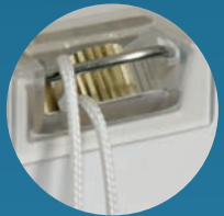
Cordlock with brass roller