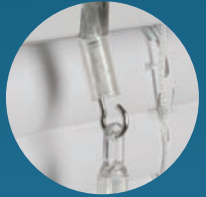
Heavy duty tilter with metal rivet